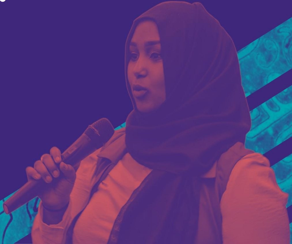
Image © Michael Benjamin Williams-St Louis, C4Yourself Productions. Image © Dan Salter Photography for Compton Verney, Warwickshire